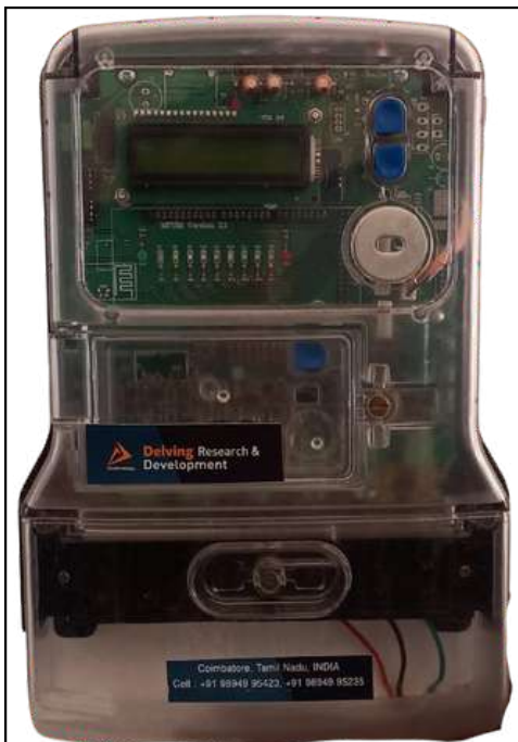
DelSmart - IoT Based Energy Meter

DelSmart - IoT Based Three Phase Energy Meter is designed to categorize consumers in distribution networks.